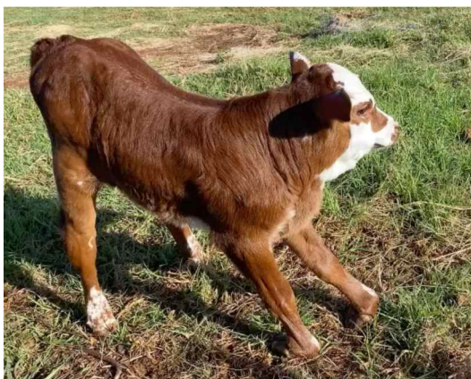
Before: Born with contracted tendons, struggling to stand.

ON THE FARM, SMALL ACTIONS TAKEN AT THE RIGHT TIME OFTEN LEAD TO THE BIGGEST RESULTS.