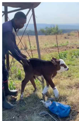
During: Supported with gentle physio and handmade splints.