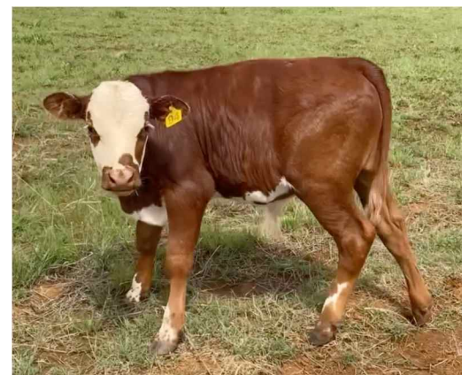
After: Fully recovered, walking confidently on his own.